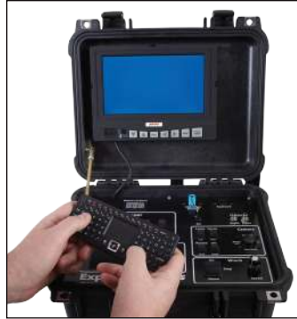
Wireless keyboard and integrated overlay for video titling