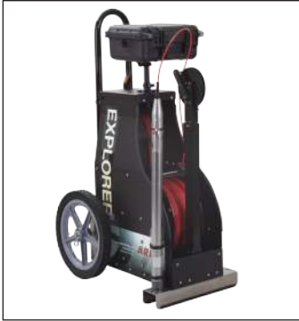
Compact, integrated system for great maneuverability