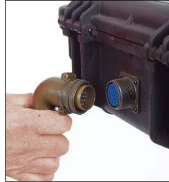
Quick disconnect plug for easy removal of control unit