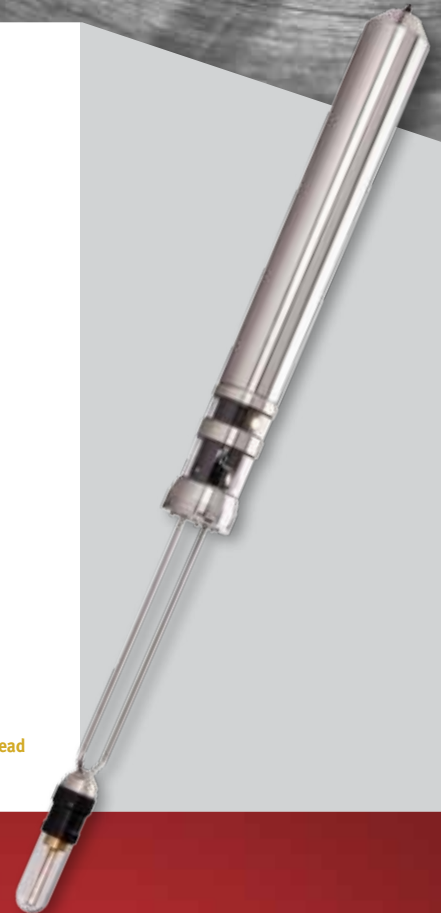
BT9700 camera with LED lighthead