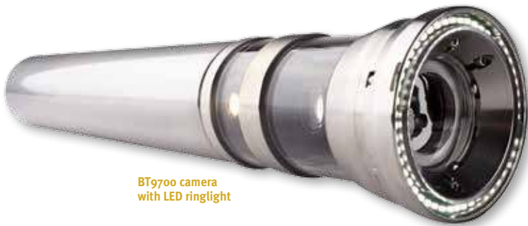
BT9700 camera with LED ringlight

The camera's single-module design allows it to tilt off-center and zoom in both views. This unique operating benefit produces clear, quality images to more accurately evaluate difficult conditions.