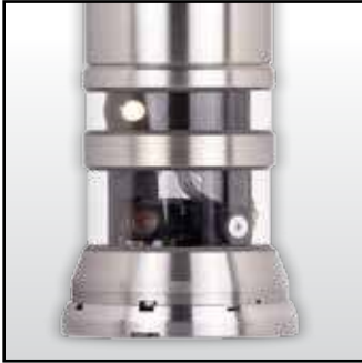
Unique pan and tilt camera movement provides superior well casing examination